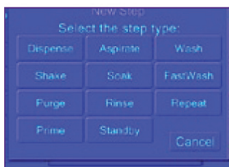
Figure 3. Touchscreen system control. Using the front panel LCD, program control features can be easily selected to set up, edit, delete, copy, and rename wash protocols, create new microplates in the microplate library, or perform washer maintenance.